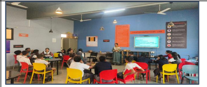
English Grammar Quiz Competition