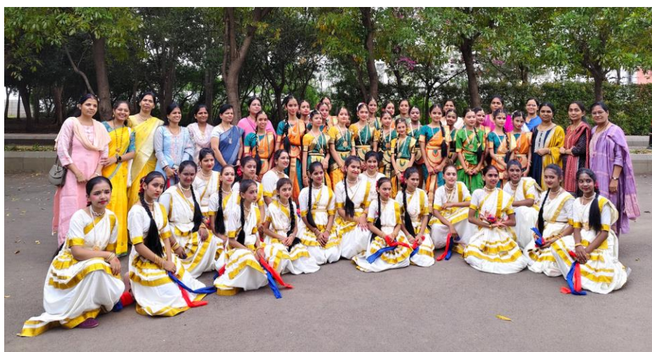
Raising day celebration, Dance performance at 16/10/2025