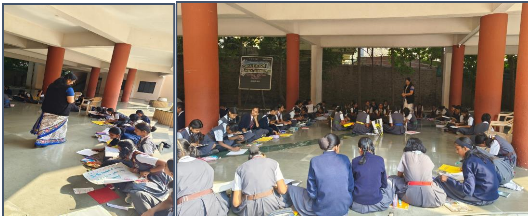
Constitution Week Celebration