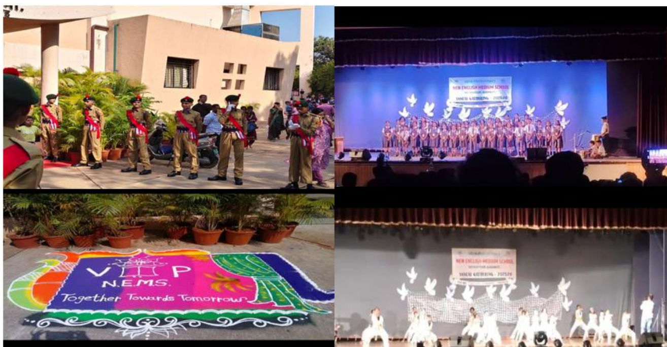
Annual Day 29/11/2025, Theme-Together Towards Tomorrow