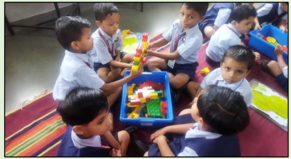
Robo Wizard (RWE)