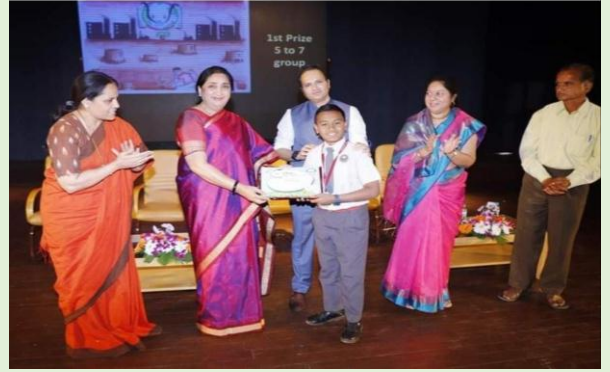
First prize in speech competition and Third prize under Individual Category at KARBHARI CHASAK.